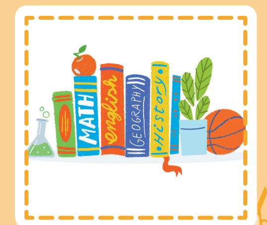
Explore child rights in different subjects.