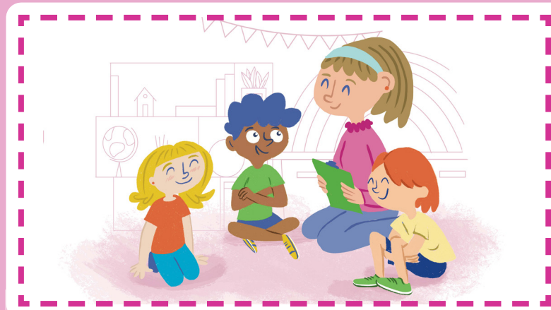
Teachers and children discuss and decide together what and how they will learn.