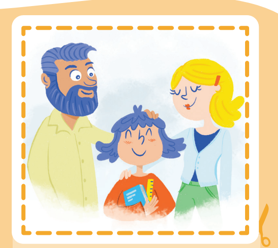
Teach parents and carers about child rights.