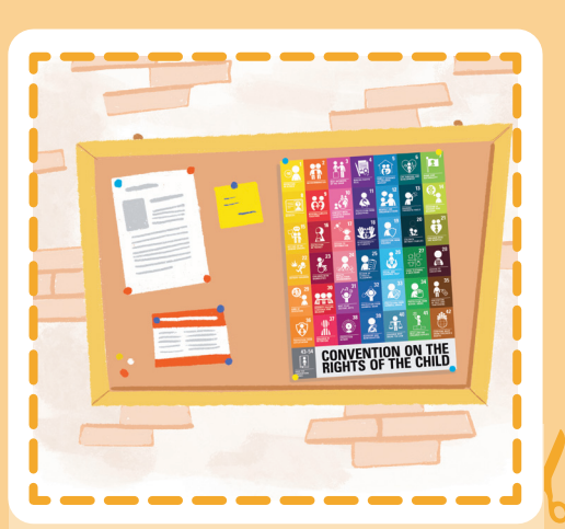
Display child rights around the school.